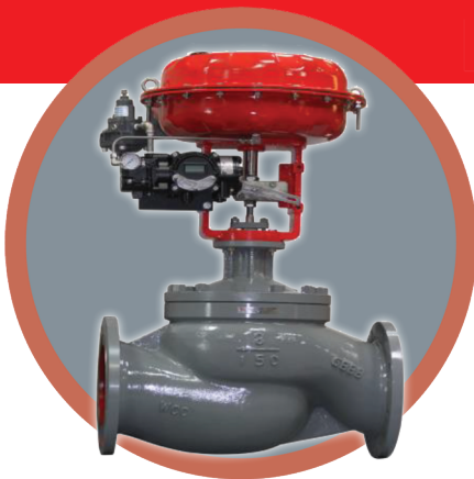
4000 Series Anti-Cavitation Trim Globe Control Valve