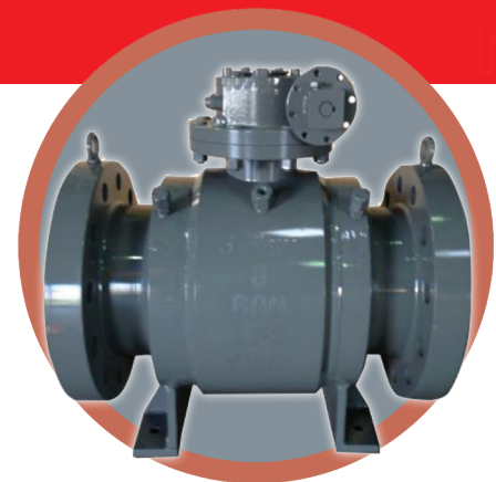
9500 Series Fully Welded Trunnion Valve